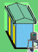
2 stance Mobilet® with hand wash facility

Delivery and Installation: We are committed to delivery, installation and commission of all AquaSan OneStop ® Packages. Please request a detailed quotation for every package, as price will vary by location and conditions on the ground.