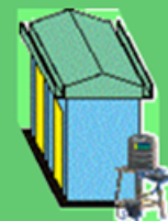
2 stance Mobilet® with hand wash facility

Delivery and Installation: We are committed to delivery, installation and commission of all AquaSan OneStop® Packages. Please request a detailed quotation for every package, as price will vary by location and conditions on the ground.